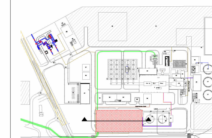
Key Plan 1 : 6000