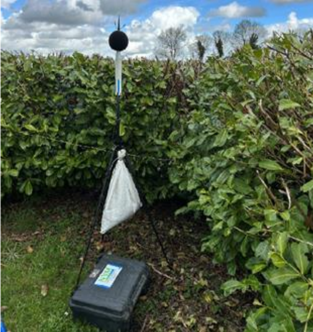
Plate 7: View of Location M7.

Location M8 (Coordinates: 53.3922107, -7.2536459) is within the Derrygreenagh facility on the western edge of the compound. It is surrounded on all sides by open bogland. The noise levels here would also be affected by the operation of the facility, with slow moving vehicles.