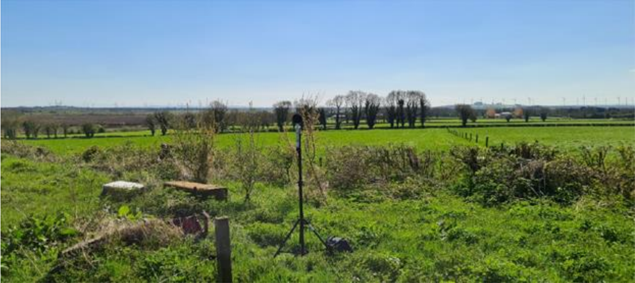
Plate 3: View of Location M3.

Location M4 (Coordinates: 53.3429941; -7.2469539) is an isolated farmhouse in Togher. It is surrounded by open bogland on its northern and western sides, and open farmland to the south and west.