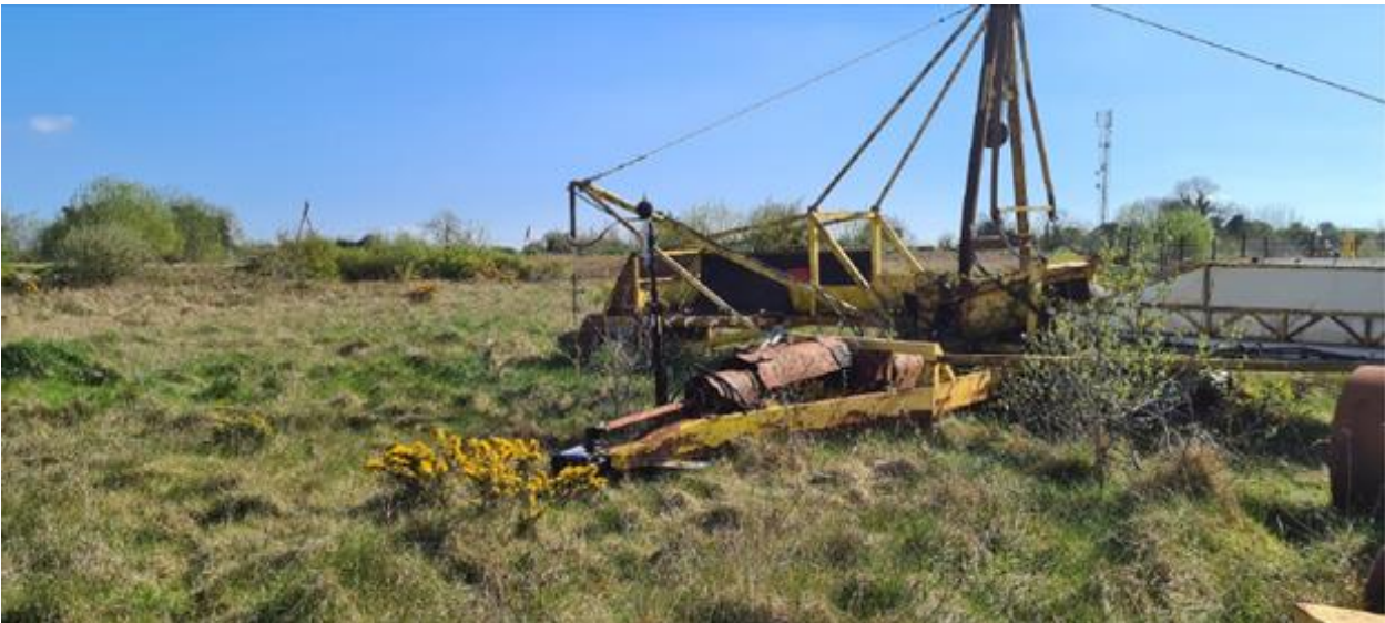
Plate 8: View of Location M8.

Location M8 (Coordinates: 53.3922107, -7.2536459) is within the Derrygreenagh facility on the western edge of the compound. It is surrounded on all sides by open bogland. The noise levels here would also be affected by the operation of the facility, with slow moving vehicles.