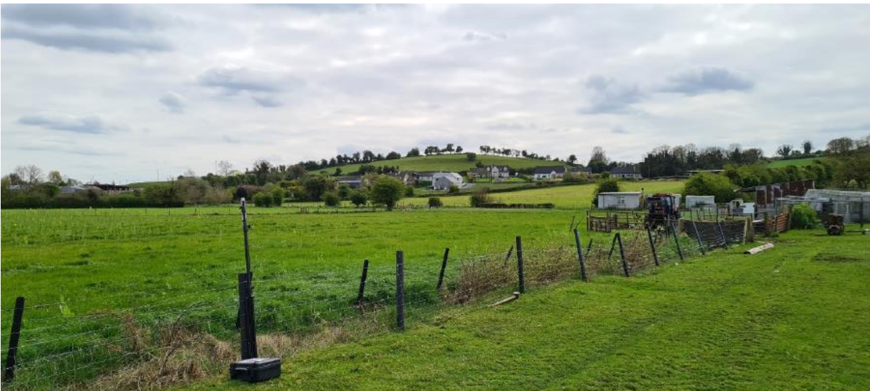
Plate 4: View of Location M4.

Location M4 (Coordinates: 53.3429941; -7.2469539) is an isolated farmhouse in Togher. It is surrounded by open bogland on its northern and western sides, and open farmland to the south and west.