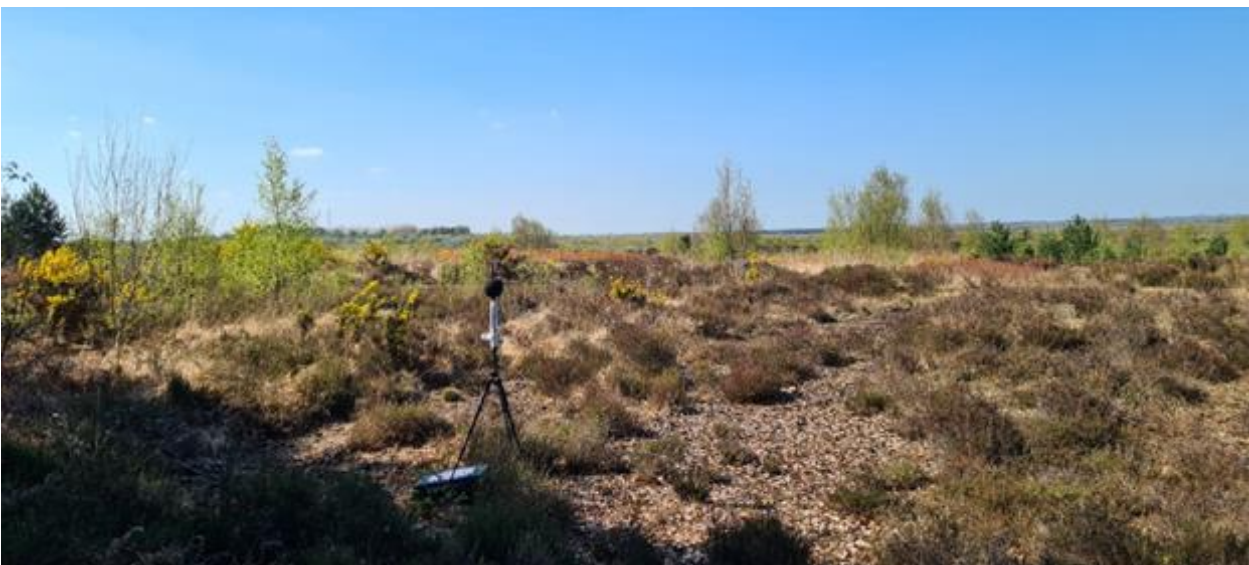
Plate 6: View of Location M6.

Location M6 (Coordinates: 53.3872659; -7.2408631) is on the edge of the bog area to the east of the Derrygreenagh facility. There are residential properties further up the road.