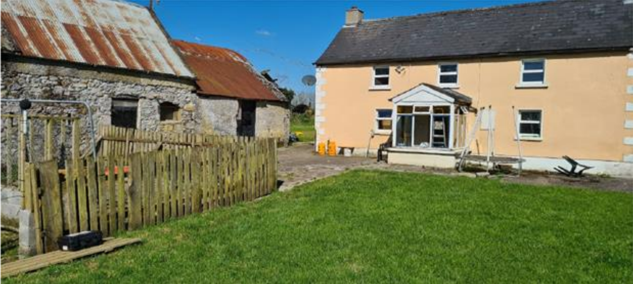
Plate 1: View of Location M1.

Location M2 (Coordinates: 53.3287816; -7.2520075) is a working dog kennel located to the west of Location M1 at the end of a long cul-de-sac, also in Coole. It is surrounded by open farmland. The nearest open bog is approximately 800m to the east.