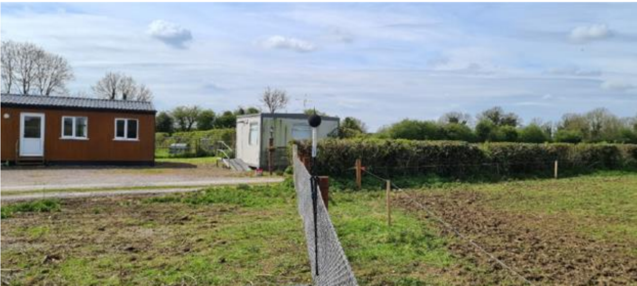
Plate 2: View of Location M2.

Location M2 (Coordinates: 53.3287816; -7.2520075) is a working dog kennel located to the west of Location M1 at the end of a long cul-de-sac, also in Coole. It is surrounded by open farmland. The nearest open bog is approximately 800m to the east.