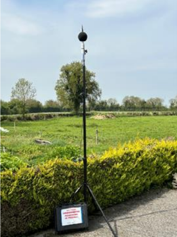
Plate 5: View of Location M5.

Location M6 (Coordinates: 53.3872659; -7.2408631) is on the edge of the bog area to the east of the Derrygreenagh facility. There are residential properties further up the road.