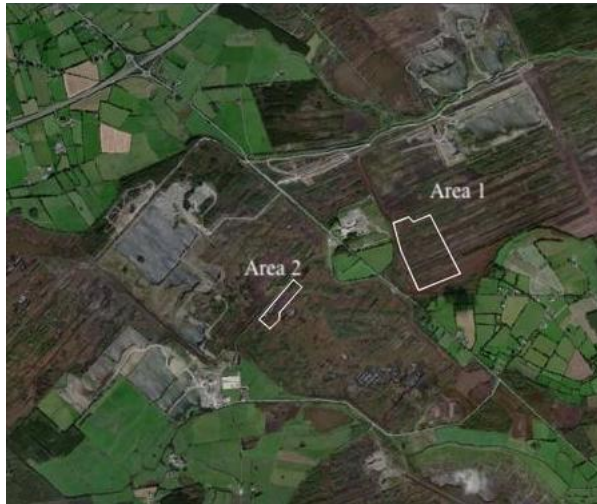
Fig. 3: Aerial view of Areas 1 and 2.