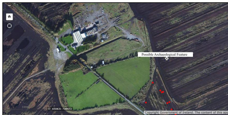
Fig. 6: Location of possible archaeological feature identified in Area 1.