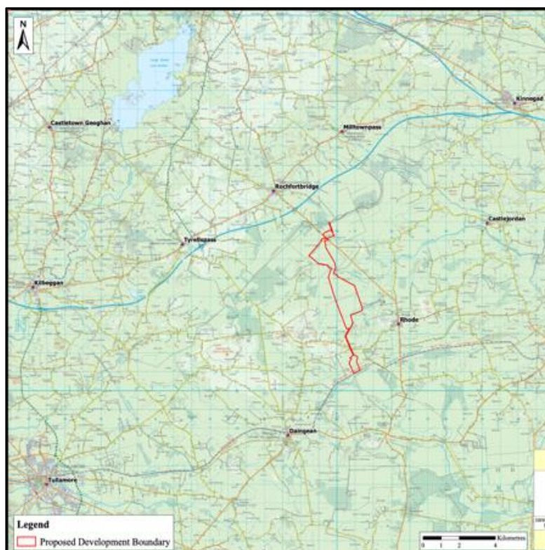
Fig. 1: General Site Location

The site is located approximately 2.2 km south of the M6 motorway junction 3 for Rhode and Rochfortbridge, on the R400 road and extends S to the Royal Canal.