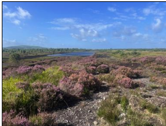
Plate 6: View of area from NE with large area under water in centre of Area 2.