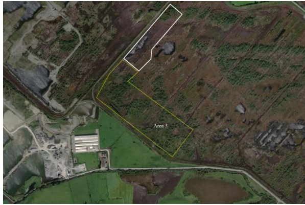
Fig. 4: Aerial view of Areas 2 and 3.