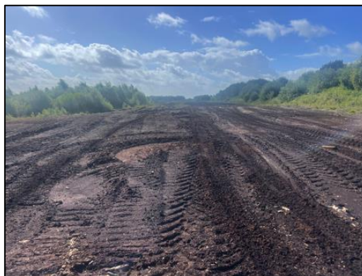
Plate 1: View of tract of peat used as accessway in W of Area 1.

Area 1 is located in Drumman Bog in the townland of Derrygreenagh and Knockdrin, to the E of the BnM compound. Orientated NW-SE, it was defined by a raised bank/ accessway in W and S. The area incorporates a number of roughly E-W running milled peat fields with drainage ditches on either side. Some of the fields are overgrown or partially overgrown. All accessible fields were walked. A number of natural timbers were recorded on the surface. In the E of the area (ITM 0649929 0738100 ) one timber was identified, partially buried and extends for length of 15m in length (Fig. 6). No archaeological features and/or finds were recorded in the rest of the area.