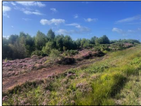
Plate 5: General view of scrub/vegetation in the NE of Area 2.

Area 2 is located in Derryarkin Bog, in the townland of Derrygreenagh, to SW of the Compound off the R400 and to SE of a railway track. The area was defined by an embankment to the immediate E of track and areas of thick vegetation to NE and SW. A large area of the site in centre is under water and either side of this was field walked. There is a second area of water located in SE of site. Occasional pieces of unworked timber on surface. No archaeological features and/or finds were recorded in the area.