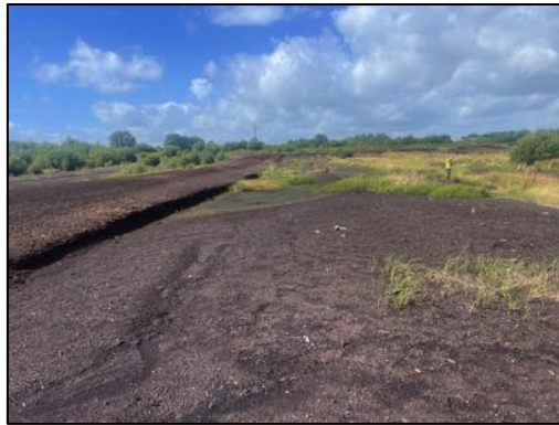
Plate 3: View of peat fields in N of Area 1.