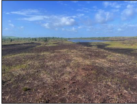
Plate 8: Looking SW from NE of Area 2.