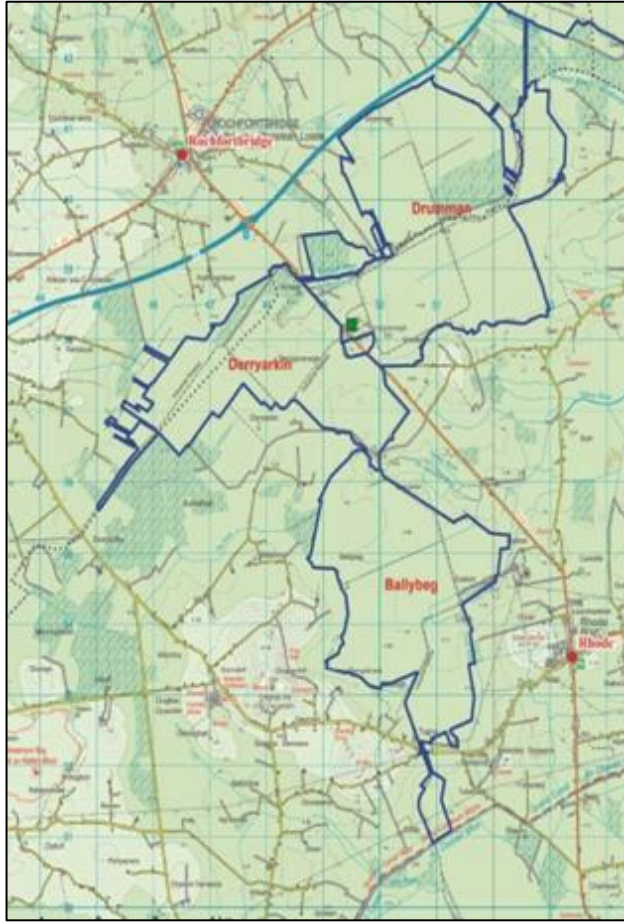
Fig. 2: Layout of the three bogs.