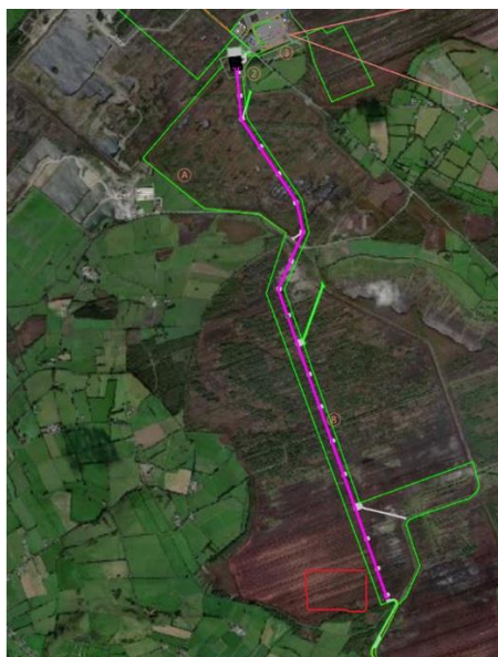
Fig. 5: Aerial view of Area 4 outlined in red.