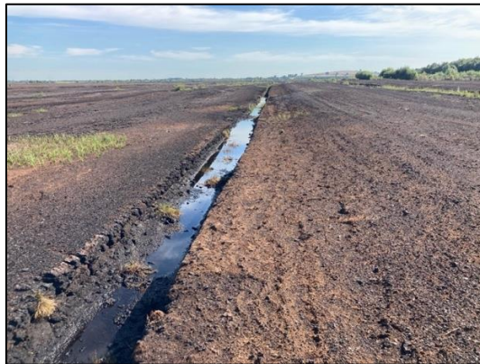
Plate 15: General view of Area 4 from the W.