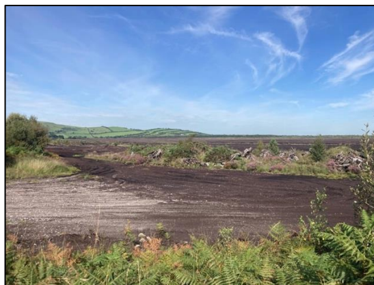
Plate 13: View of the access into Area 4, taken from the SE.

Area 4 is located in Ballybeg Bog in the townland of Barrybrook, comprised of an area orientated E-S to the W of a N-W running railway. The area incorporates a number of roughly E-W running milled peat fields with drainage ditches on either side. A number of natural timbers were recorded on the surface. Examination of the drains and field surface recorded no features and/or finds of archaeological significance.