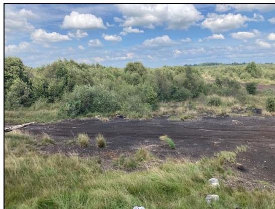
Plate 10: General view of Area 3, taken in the SW looking E.

Area 3 is located in Derryarkin Bog, in the townland of Derrygreenagh, adjacent to Area 2, orientated NW-SE, it is defined along the E boundary by the roadway into Kilmurry Sand and Gravel. Much of this area is overgrown and inaccessible, however there are a number of NW-SE running access ways and these were walked. No archaeological features and/or finds were recorded in the area.