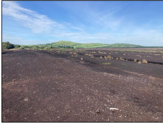
Plate 14: General view of Area 4 taken from the SE.