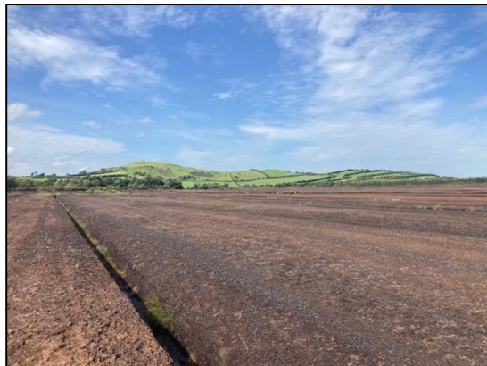
Plate 16: View of Croghan Hill from the middle of Area 4, taken from the E.