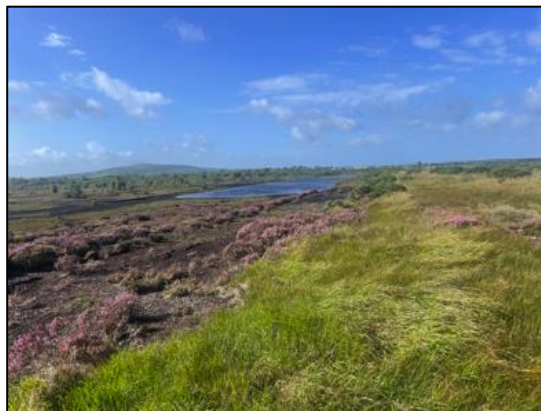
Plate 7: View from N with embankment shown.