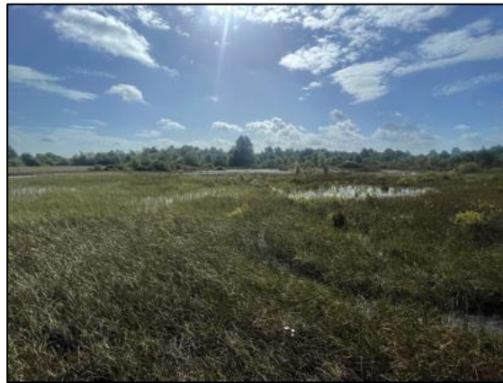
Plate 9: Waterlogged area in E and SE of Area 2.