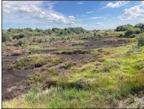
Plate 11: View of the Area 3 from the NW looking S.