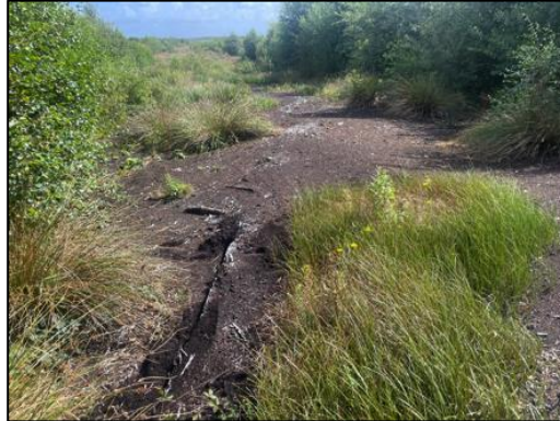
Plate 4: View of timber identified in Area 1.