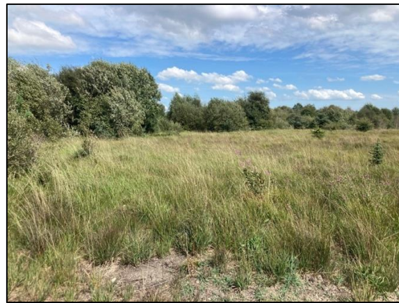
Plate 12: View of areas overgrown with grass in Area 3.