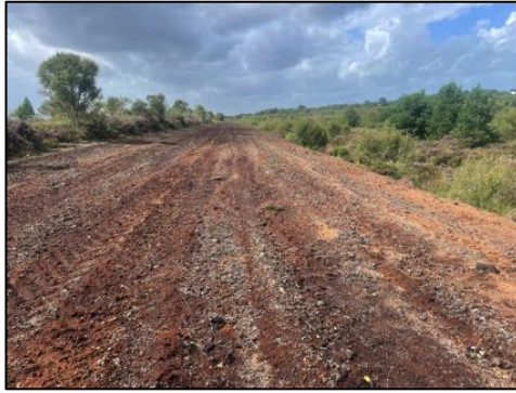
Plate 2: View of tract of peat, used for access, in S of Area 1, with overgrown field to immediate N.